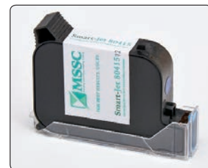
TIJ cartridge technology