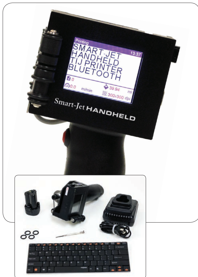
Pieces included in package