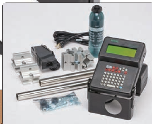
Pieces included in package