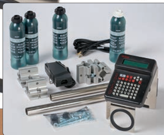
Pieces included in package